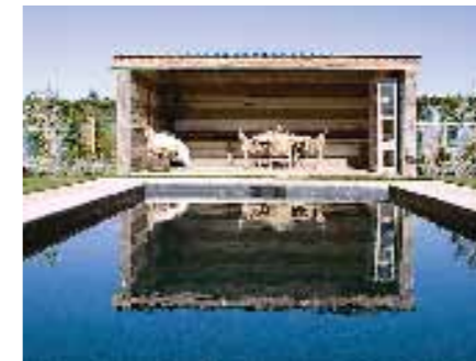
Right: The heated swimming pool and pool house; (below) the stylish living room.