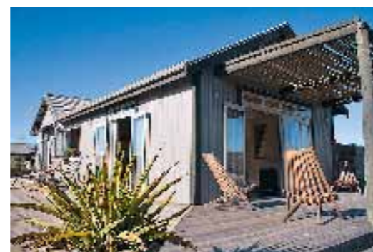
Top image: Dry Paddocks is surrounded by, well, dry paddocks; (lower images) the two-bedroom cottage is an oasis of comfort.

Getting there with Air New Zealand To book flights, hotels, rental cars and more visit airnewzealand.co.nz and click on "Holidays", phone 0800 747 222 (NZ only) or call into your nearest Air New Zealand Holidays Store.